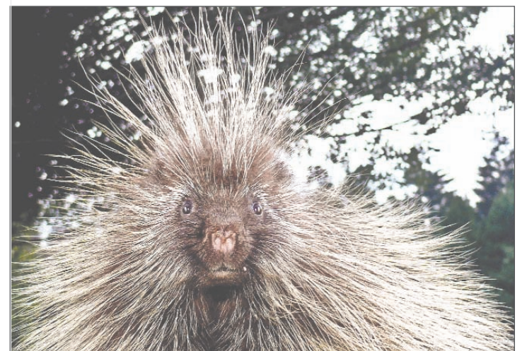
Next week in the Port Orford News